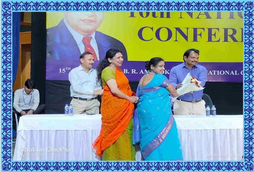
[ 15 ]