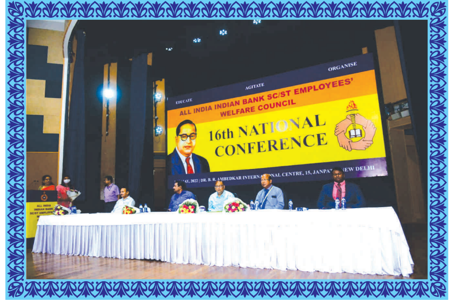
[ 16 ]